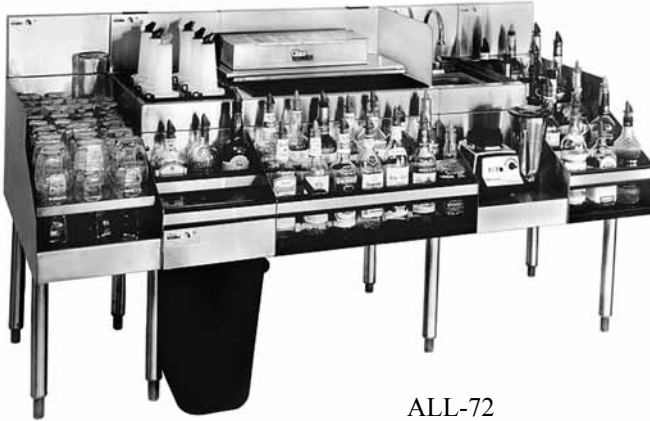
ALL-72 (Juice Bottles, Waste Receptacle, and Blender Not Included)