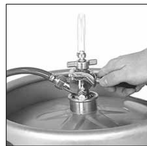
Pull the handle out and push it down to the locked position, which activates the pressure and beer lines. You are now ready to draw beer.

NOTE: When removing a keg tap, first turn off the secondary regulator to the tap, located by following the red air line from the keg tap to the secondary regulator shut-off valve. Pictured to the right is a sample two product secondary regulator with shut-off valves in the closed or off position.