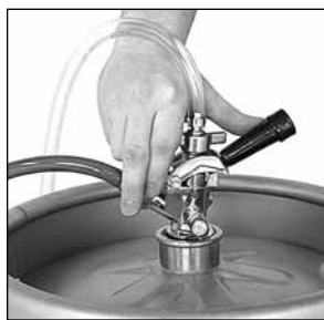
Turn the handle clockwise a \frac{1}{4} turn.