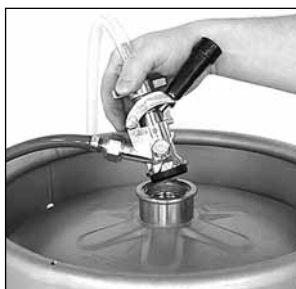
Position the tap head in the barrel neck.

Glastender normally provides a lever-type keg tap for each keg in the beer system. Please refer to the following instructions when placing a keg tap on the barrel.